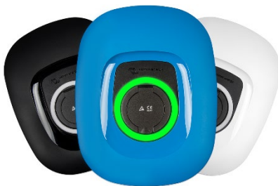
Black, blue (default) or white front